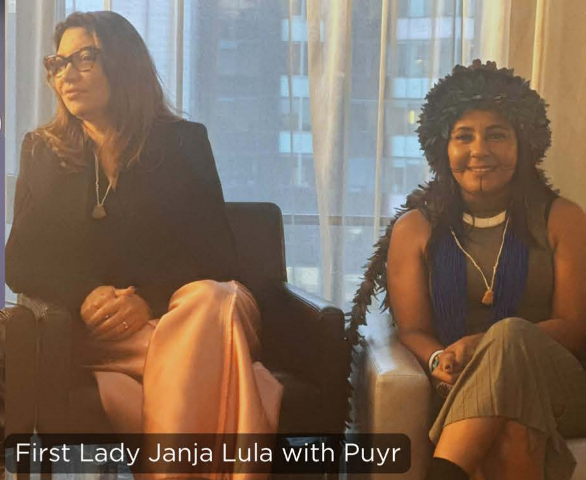
First Lady Janja Lula with Puyr