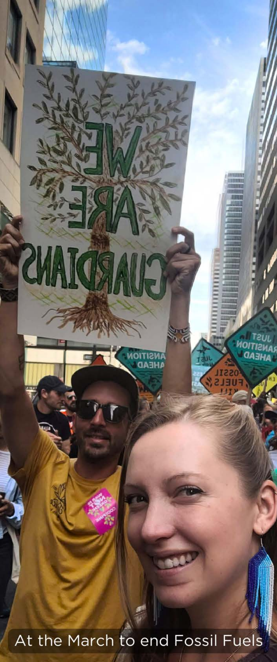
At the March to end Fossil Fuels